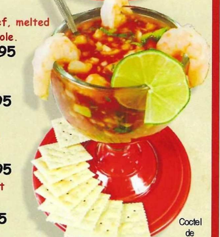
Coctel de Camarones